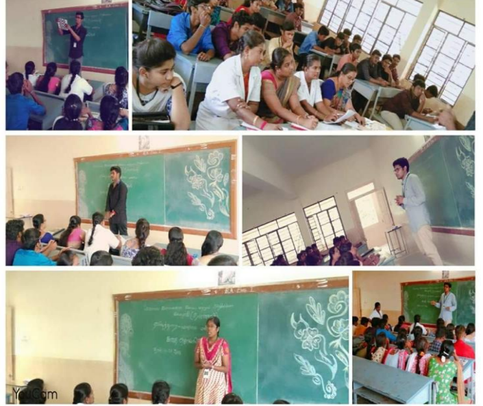
01.08.2019 கதை சொல்லிகள் - யாழிசை மன்றம் முதலாமாண்டு மாணவர்கள் பங்கேற்பு