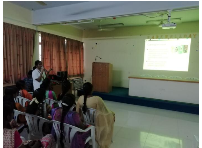
The Bridge Course on “Basics of Computer Terminology” for I Year UG Students was conducted by Department faculties on 20.06.2019.