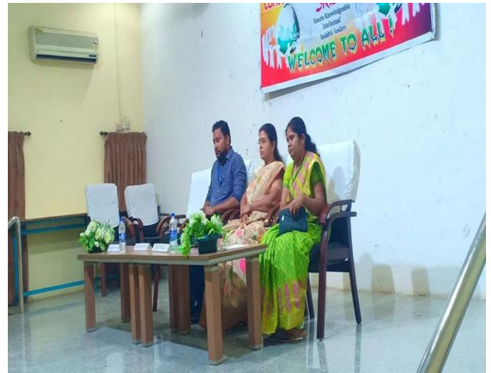
Seminar conducted on “Opportunities and Challenges in Exporting Goods” on 16.09.2019