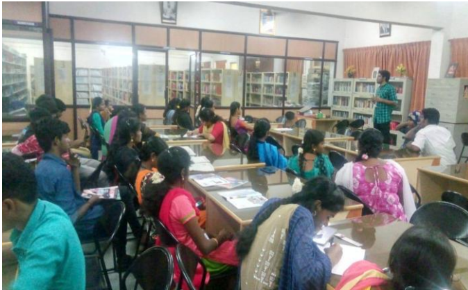
The 127 th Birthday celebration of Dr.S.R.Ranganathan Father of Library Science was conducted with Essay Writing and Oratorical Competitions on 13.08.2019.