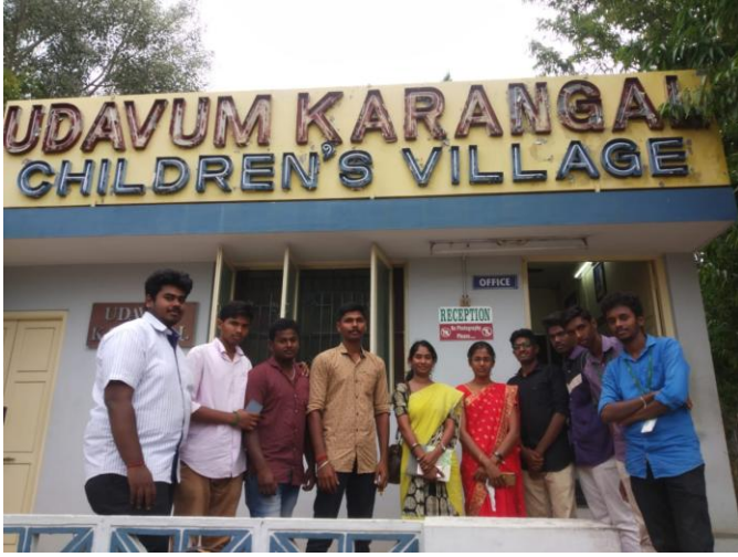
An Extension Activity by visiting an Orphanage of Udhavum Karangal, Vadavalli on 25.09.2019.