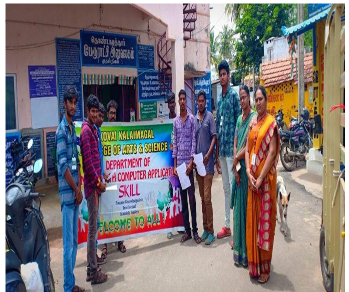
Extension Activity by “Creating Awareness on Central Government Schemes for Starting a new Business” on 18.09.2019.